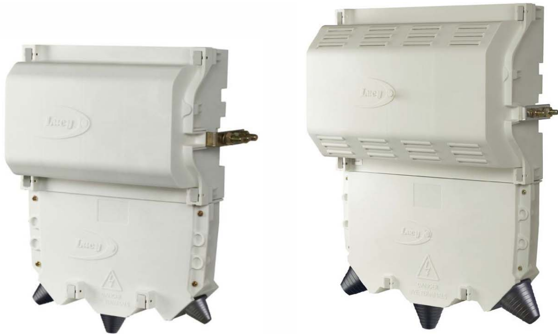
200A HDCO with cable trough

All insulated Heavy Duty Cut-out with three in-line BS 88 J type slotted tag fuse links for indoor installation.