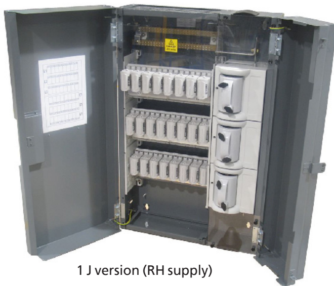
1 J version (RH supply)

Mild steel wall mounting distribution boards for 3 phase systems configurable with either a single incoming bank of triple pole J type slotted tag fuses or with an additional outgoing bank of triple pole J type fuses for mixed developments requiring a split supply greater than 100A.