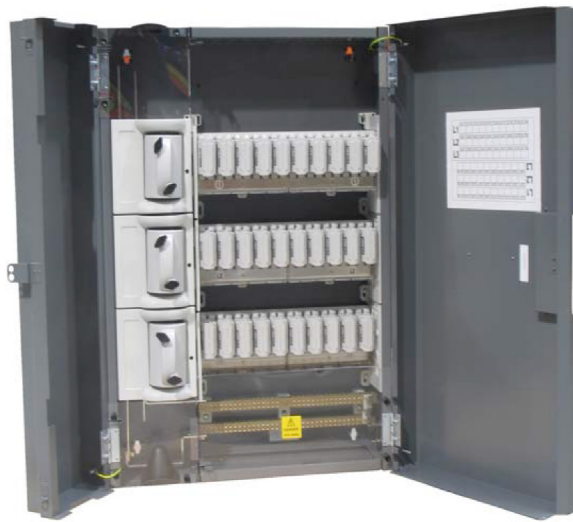
1 J version (LH supply)

Mild steel wall mounting distribution boards for 3 phase systems configurable with either a single incoming bank of triple pole J type slotted tag fuses or with an additional outgoing bank of triple pole J type fuses for mixed developments requiring a split supply greater than 100A.